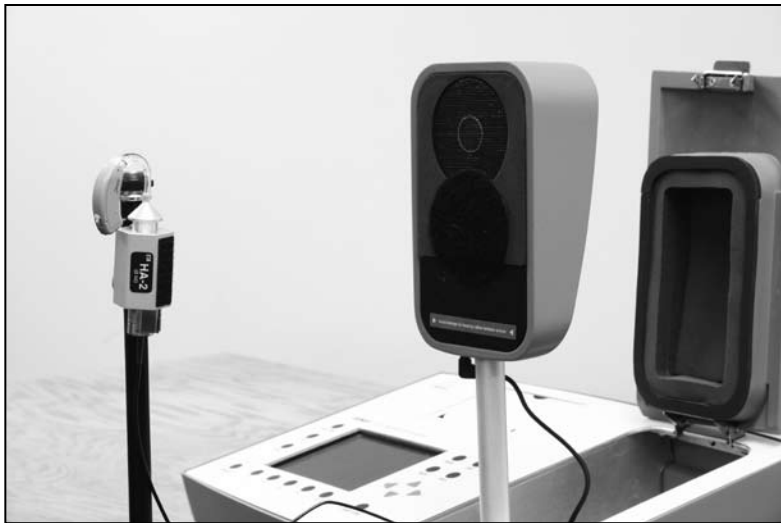
Figure 5—Forward Measurement