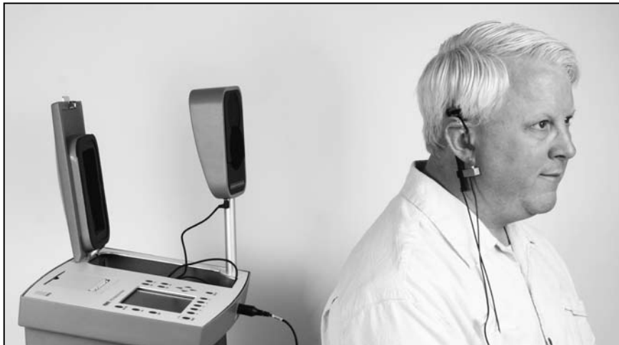
Figure 7—Reverse Measurement