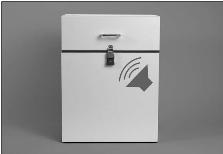
Figure 1—Sound chamber with speaker mount