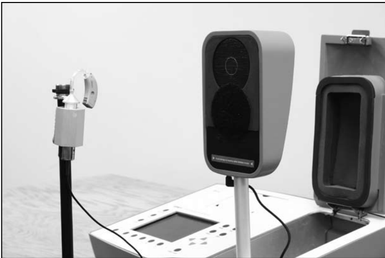
Figure 6—Reverse measurement