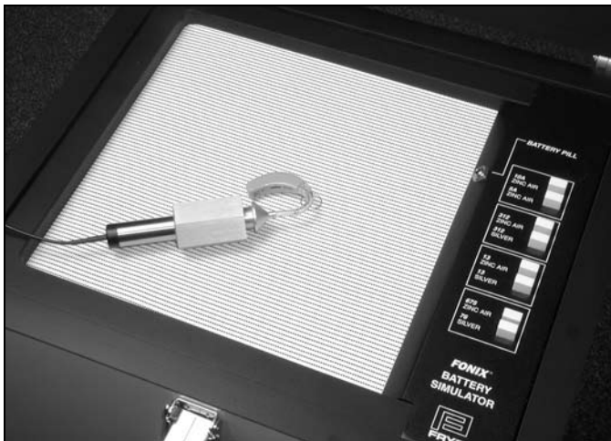
Figure 2—Forward positioning in 7020 sound chamber