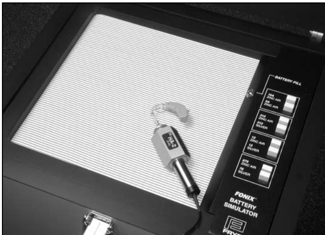
Figure 3—Reverse measurement in 7020 sound chamber