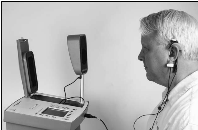
Figure 8—Forward Measurement