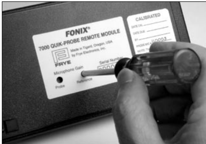
Figure B.1.C—Adjusting the reference pot with a Phillips-head screwdriver.