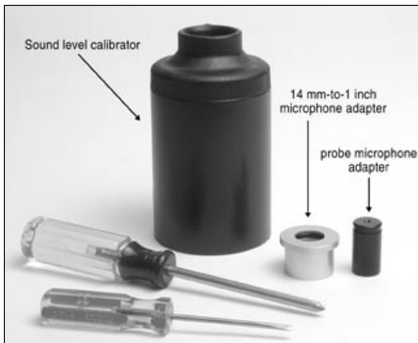
Figure B.1A—Equipment for calibrating the 7000 microphones.

To calibrate the 7000 Test System's microphones, you will need a sound level calibrator such as the Quest CA-12, the 14mm-to-1 inch microphone adapter provided with your 7000 Test System, and a small flathead screwdriver. If you are calibrating the probe microphone, you will also need the probe microphone adapter and a Phillips-head screwdriver.