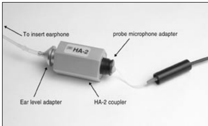
Figure B.2—Calibrating the insert earphone