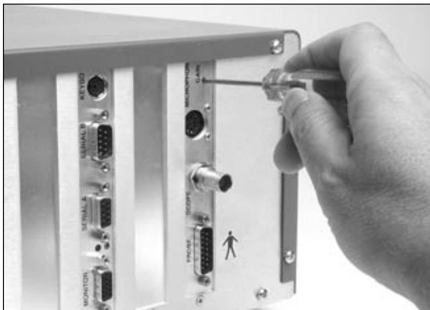
Figure B.1B—Adjusting the gain pot with a flat head screwdriver